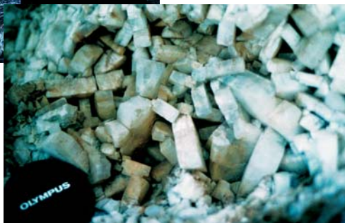
Celestite crystals at Karstryggen.

Celestite mineralisation occurs in the Karstryggen Formation over 80 km 2 of the Karstryggen plateau. It appears both in a lower 3–10 m thick algal-laminated limestone-evaporite unit where up to 80% of the calcite and gypsum can be replaced by celestite, and in an overlying c. 50 m thick karst breccia sequence. This occurs typically as large-scale veining superimposed on an intense small-scale veining and breccia filling. It is assumed that the celestite was formed by early diagenetic replacement of gypsum in the algal-laminated limestone during interaction with Sr-enriched terrestrial ground water.