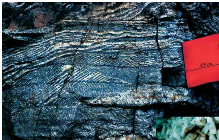
'Zebra' barite at Zebra Klint, Bredehorn.

some 330,000 tons with 90–95% barite has been indicated in a shallow sub-surface by a few drill holes.