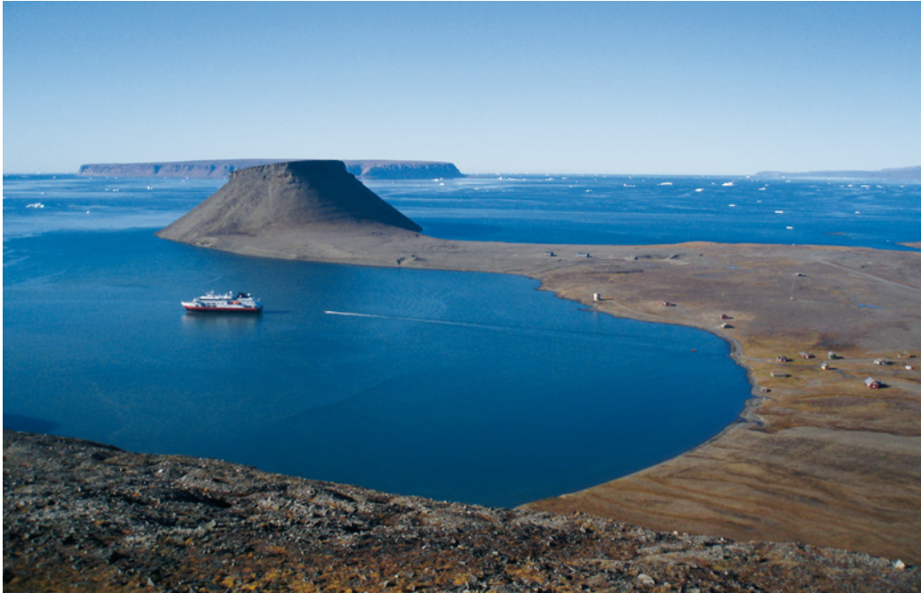
The landmark of the Thule region, table mountain Dundas Fjeld (Ummannaq) 225 m high. Dundas Group is capped by a Neoproterozoic Franklinian basalt sill.

Narsârssuk Group. This group represents the youngest strata. It is 1.5–2.5 km thick composed of dominantly fine-grained carbonate–red bed siliciclastic rocks with evaporites representing cyclic deposition in a low energy, hypersaline, peritidal environment.