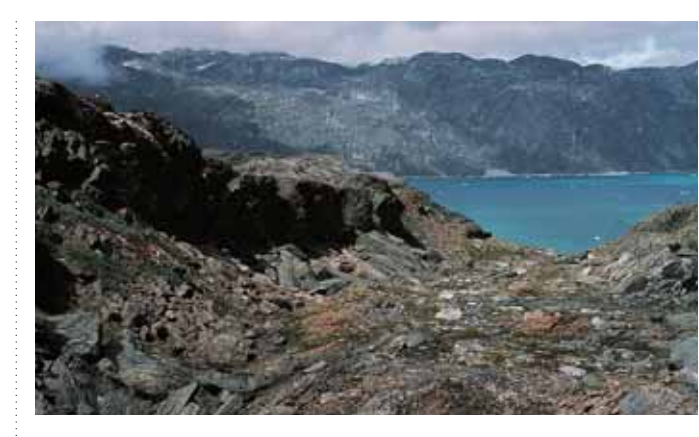
Nuuluk gold locality within the greenstone of the 'Tartoq Group south of the fjord Sermiligaarsuk, South-West Greenland.

The southern area (Nuuluk) includes a prominent zone of high-strain rocks - the Nuuluk Linear Belt. The belt is 400 x 4000 m, and is characterised by nearly parallel structures and numerous thrusts. This sequence is composed of mixed layers of brown weathered carbonate schist, nodular greenschists and highly sheared volcanochemical sediments including iron oxide schists, graphitic shales and sericite schists.