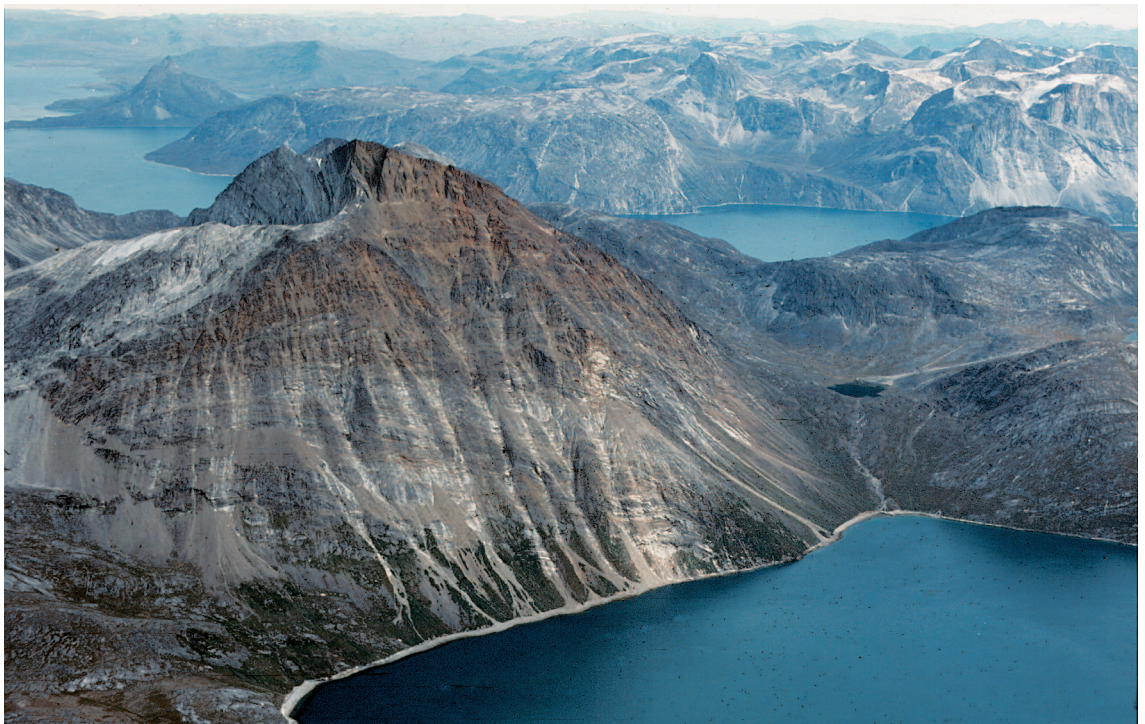
Rusty Archaean greenstones with gold mineralisation, located adjacent to a major terrane boundary, Storø, Godthåbsfjord.

The discovery is a result of two drilling campaigns in 1995 by NunaOil A/S. The obtained results are up to 6