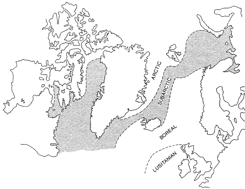
Fig. 5. Regional division of the European seas according to Simonarson et al. (1998).

of mostly tiny specimens which might be more looked for in the geological samples than in the recent bottom samples often used in the more practical work of evaluation benthos introduced by C.G.J. Petersen. However, many of these small species should be considered with the utmost care, with respect to the difficulty of identifying them to species level within subfossil material.