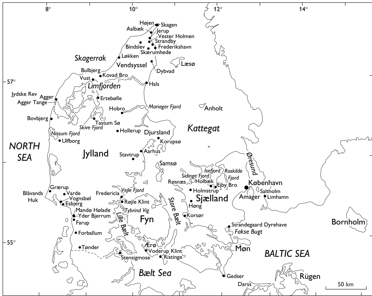
Fig. 1. Location map with Late Quaternary marine localities and names of areas on land and of Danish waters.