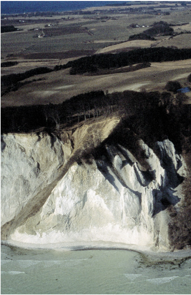
Fig. 2. Oblique aerial photograph of the c. 90 m high chalk cliff at Store Stejlebjerg prior to the rock fall. The photograph was taken on 13 March 2003 as part of a systematic photogrammetric survey aiming at an aerotriangulation of the Møns Klint cross-section for future examinations of structural geology and landslide activity.