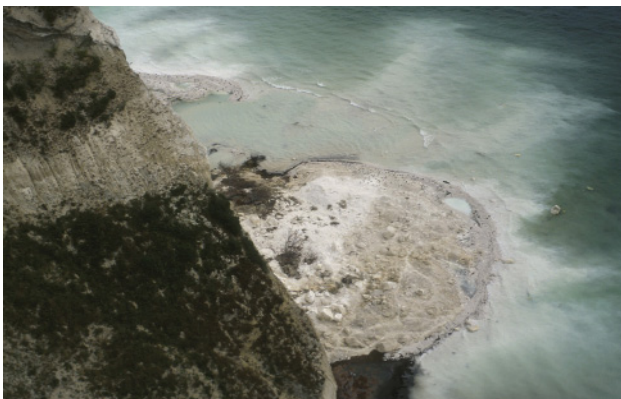
Fig. 3. The broad 90 m long peninsula formed by the rock fall seen from the top of Store Stejlebjerg on 29 August 2003. The preservation potential of these breccias is not high and the peninsula will probably be lost to erosion in about three years.

focused on are azimuthal resistivity measurements, microseismicity and acoustic emission, and the project also aims at contributing to the understanding of the physical properties of rock masses which lead to unstable cliffs and failures. The project works closely with user communities in order to ensure that development is adapted to user requirements. This includes issuing informed hazard warnings in areas around cliffs, providing information for land-use planning in the coastal zone and conservation regulations, and maximising the use of the cliffed coastline as an amenity (Busby et al. 2002).